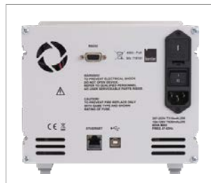
Rückseite mit Anschlüssen