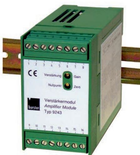
Rail mounting module