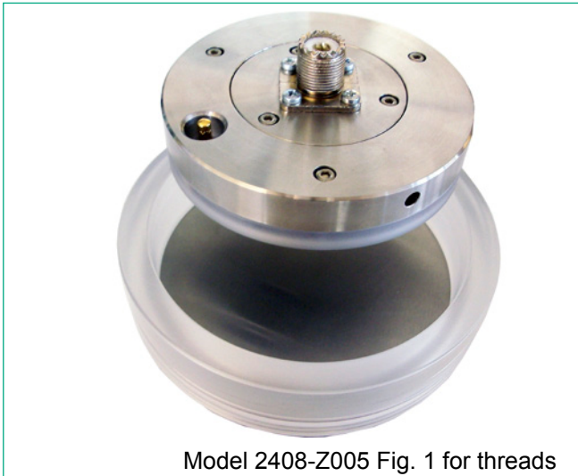
Model 2408-Z005 Fig. 1 for threads