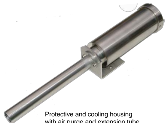
Protective and cooling housing with air purge and extension tube