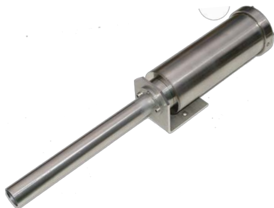
Protective and cooling housing with airpurg and extension tube