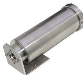
Protective and cooling housing WK15