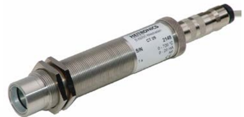
CT09 Dimensions in mm