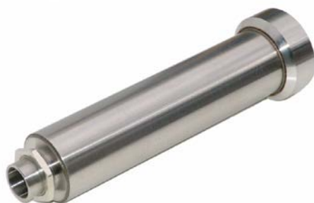
Protective and cooling housing WK11